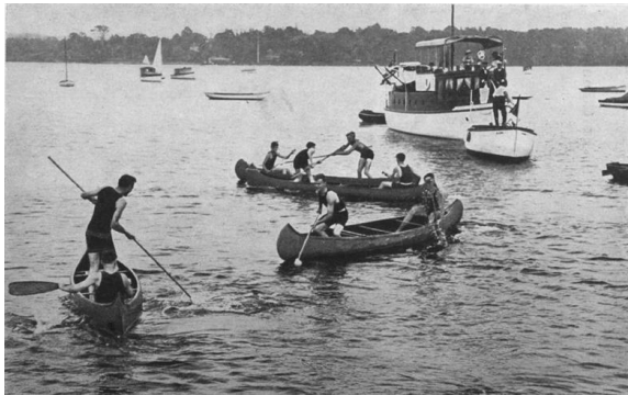
Little Neck Bay in July 1918