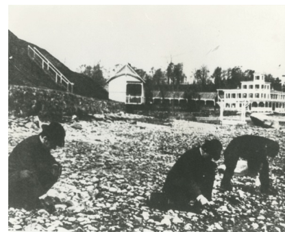
Clamming with Crocheron Hotel in back