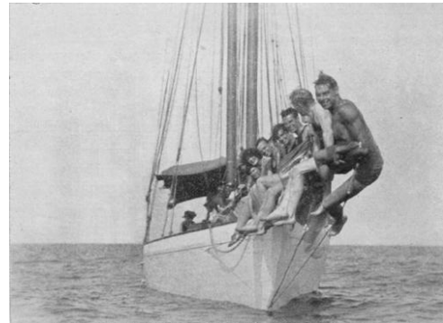
Bayside Yacht Club 1927