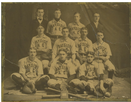
Bayside Baseball Team from 1900